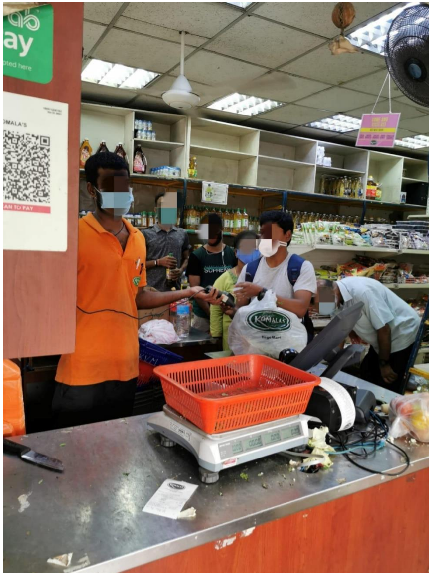
Komala's Vege Mart Pte Ltd (125 Dunlop Street) fined S$1,000 for not observing safe distancing measures. They failed to ensure proper crowd management despite earlier warnings.