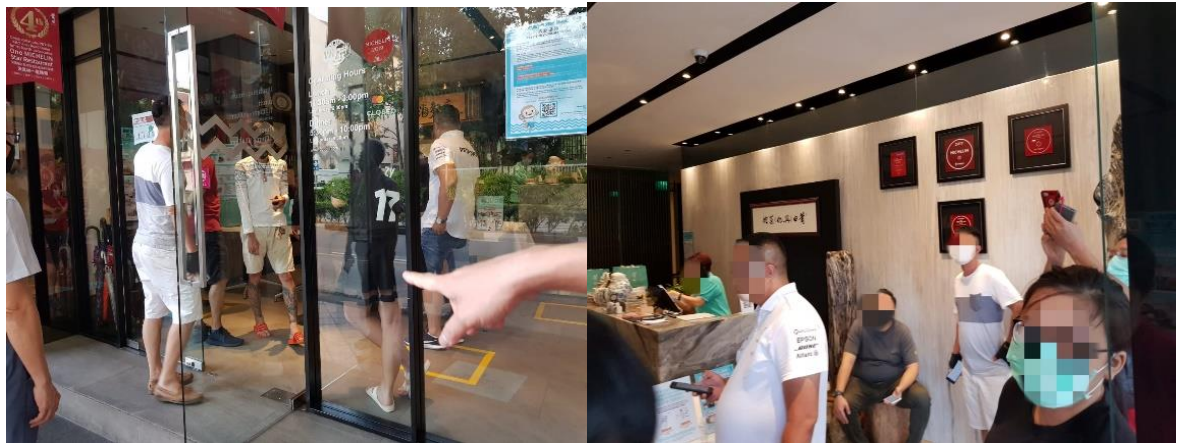
Putien (127 Kitchener Road) was issued a composition fine of $1,000 for not observing safe distancing measures despite earlier warnings. They failed to ensure proper crowd management and customers did not comply with 1m safe distancing.