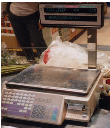
Non-automatic weighing instruments

Below are some examples of weighing and measuring instruments that are used for trade purposes that will be verified and stamped by AVs.