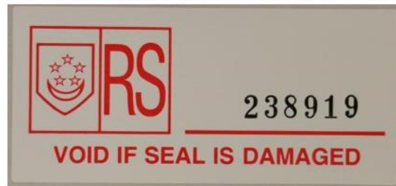
Tamper-evident paper adhesive seal